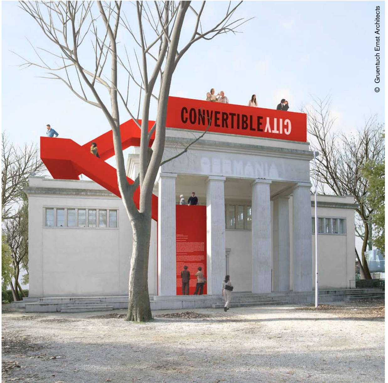
CONVERTIBLE CITY Venice