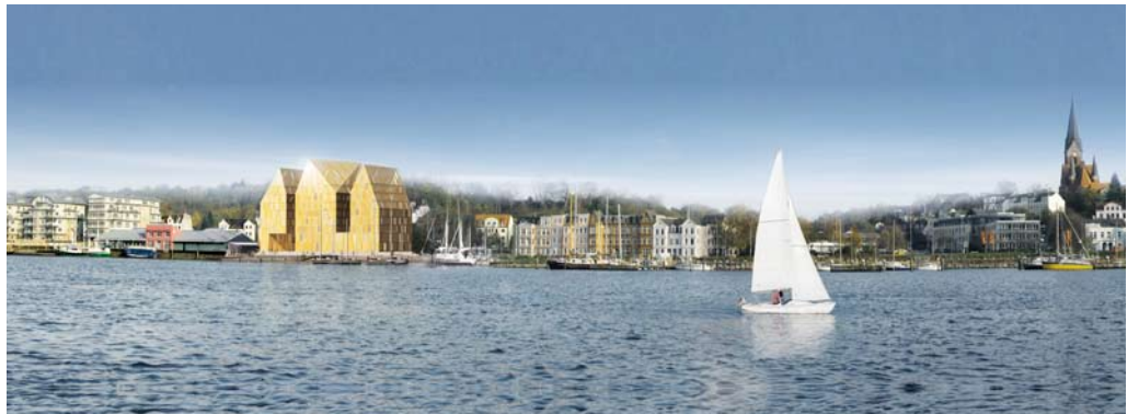
Hotel at the Flensburg fjord, competition 2006 - 1. Preis (© Gruentuch Ernst Architects)