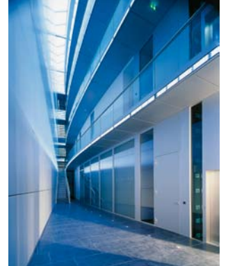
Apartment and commercial building Hackescher Markt Berlin, completion 2000