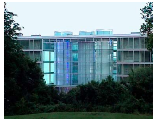
Office building Hamburg-Neumühlen, completion 2002 (© Oliver Heissner and Gruentuch Ernst Architects)