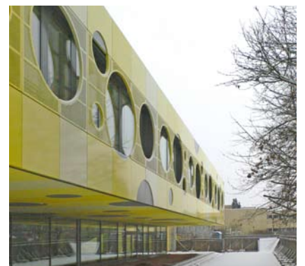
Extension of the Bruno-H. Bürgel elementary school, Berlin, completion 2006 (© Gruentuch Ernst Architects)